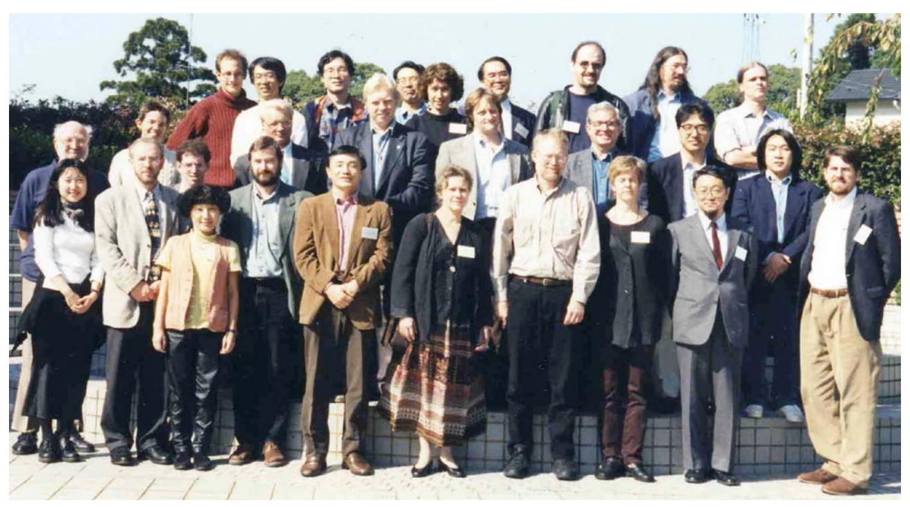
Participants in International MOX Assessment Interim Report Public Meeting, Kyoto, October 1996

Tokyo (10 pages) was sent to our friends around the world - in all 300 individuals and organizations working to bring an end to nuclear energy. Since then, the newsletter has been produced every two months for the past 17 years, this one being the 100th edition.