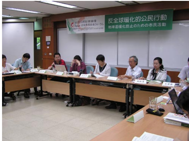
Participants in global warming working group

This time I was on a very tight schedule, so I did not have time to visit Taiwan's No. 4 power plant. It was reported that new funding has been made available and that construction is continuing. However, I was told that it is only about 60% complete. The policy of the ruling Democratic