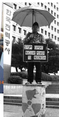
Public meeting in Tokyo (left), with local Hamaoka activists (top), in front of KEPCO in Seoul (right)

Two Indonesians opposed to their government's plan to introduce nuclear power visited Japan from July 3-9. From Japan, they continued on to South Korea before returning to Indonesia on July 12. Their visit was sponsored by NGOs working on environmental, nuclear and Indonesian solidarity issues in Japan and South Korea. It was organized in recognition of the importance of international solidarity in opposing moves to expand nuclear power in Asia.