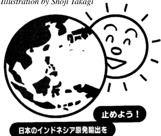
Illustration by Shoji Takagi

Stop Japan exporting nuclear reactors to Indonesia!