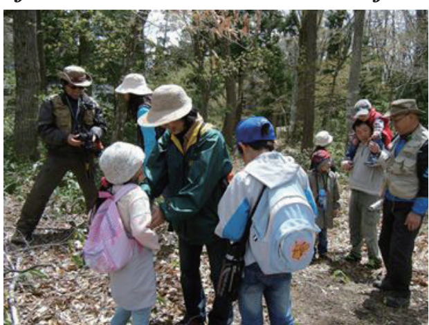
Inawashiro nature tour

A short-stay program using a shared house located in Inawashiro Town, Fukushima Prefecture, is currently underway. The house is located in a less contaminated area. During the previous programs in the Tsuchiyu Hot Springs resorts, participants were able to enjoy leisurely stays in hot-spring inns. At the shared house in Inawashiro Town, the program is slightly different. Unlike stays at inns, lodgers at the shared house prepare their meals together. Therefore we request program participants to join in with the meal preparation and dish washing. In the programs using inns, only a part of the food ingredients used for meals was selected by us. At the shared house, however, the meals are prepared entirely from ingredients