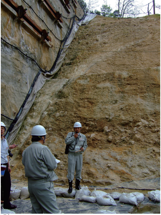
Urazoko Fault trench

In February 2005, however, the Nuclear and Industrial Safety Agency (NISA) ordered JAPC to re-investigate the Urazoko Fault as an additional requirement for approving construction of Units 3 and 4. The company therefore carried out a largescale investigation by digging trenches. In its report issued in March 2008, JAPC acknowledged for the first time that the Urazoko Fault was active. Furthermore, it was discovered that this fault had moved repeatedly since the Late Pleistocene, the