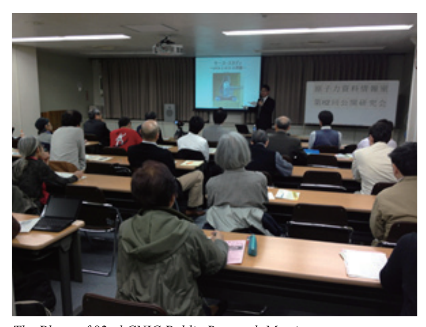
The Photo of 82nd CNIC Public Research Meeting

Also, in the case of the US regulatory system, there are firstly laws and regulations, the details of which are indicated in regulatory guidelines, in which civil criteria and notifications are referred to. Nevertheless, however meticulous the regulatory structure may be, there are always a large number of loopholes.