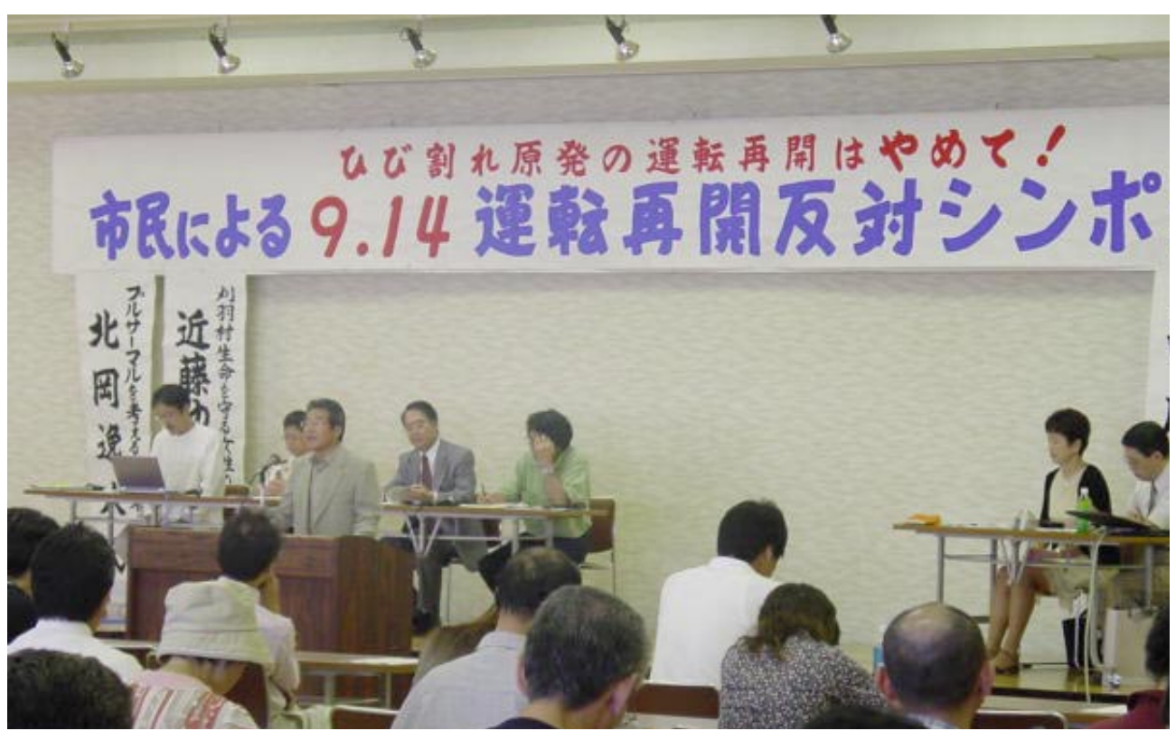
Picture above: On September 14," Stop Resuming Operation of Crack Defected NPP" was held in Kashiwazaki City where there were 200 citizens attended

n August 29 last year, an announcement was made about the long-term ccover-up regarding cracks in the reactor shroud. Over the following year, numerous horrifying facts have been revealed one after another.